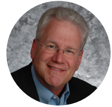
Geoffrey Moore Author Crossing the Chasm