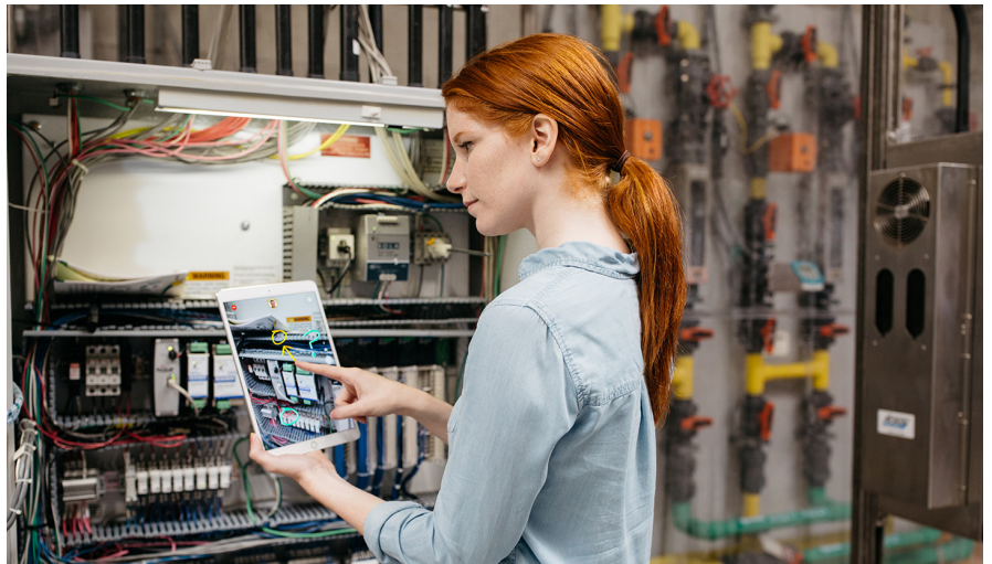
PTC’s Vuforia Chalk software, free to use during the COVID-19 lockdown (through August), points to new ways of collaboration and obtaining remote expert assistance.

The impact of the slowdown in manufacturing during the shutdown cannot be underestimated, but the crisis also opens